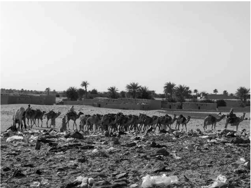
Photo I.2 Camel caravan in Faya