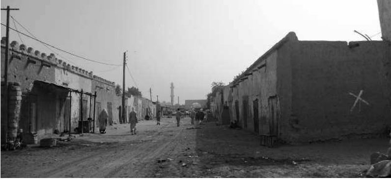
Photo I.3 Main street leading to the central market, Faya

based on myth rather than experience: it is declared ‘impossible’ of access, an impossibility that goes beyond the difficulties of transport to include intimations of an alien and dangerous sociality. Our suggestions that Chadian colleagues from the University of N’Djamena might join us there for collaborative research were thus met with the kind of embarrassed laughter reserved for foreigners ignorant of local fact. This seems strange for a place that otherwise appears to be at the heart of the Chadian political system; that has, over the last forty years, been crucial for the trajectories of three presidents (all of whom have come to power in a coup d’état); that has been of strategic importance to three armies, Libyan, French and Chadian; and that is seen, by most Chadians also, to be central to contemporary politics. This lack of knowledge combined with a surfeit of more abstract external interest has led to a portrayal of the region as unknowable and uncontrollable: Faya, with its atmosphere of slow but ineluctable decline, of despondency and inattention, is a place where much happens without ever being contained in a historical narrative, even of intelligible resistance.