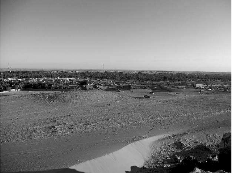
Photo I.1 Faya seen from the north