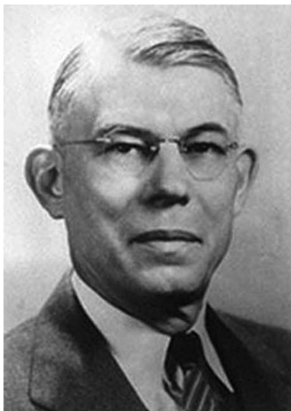
Edward Adelbert Doisy