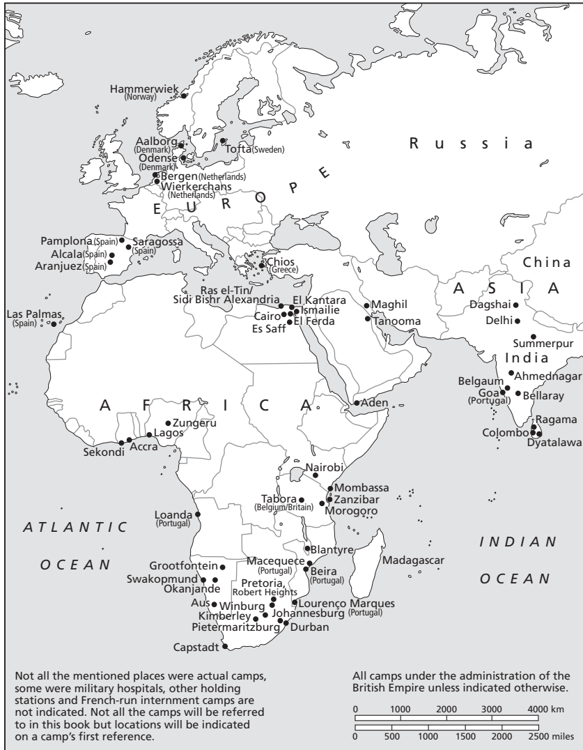
Map 1 Locations of internment camps in Africa and India with numbers indicating camp locations. Redrawn from the original found in Hamburgischer Landesverein vom Roten Kreuz, Ausschuß für Deutsche Kriegsgefangene, Karte von Großbritannien, Italien, Japan und den überseeischen Ländern: in denen sich Kriegs- oder Zivilgefangene befinden sowie Bestimmungen über den Postverkehr (Friedrichsen, Hamburg, 1917).