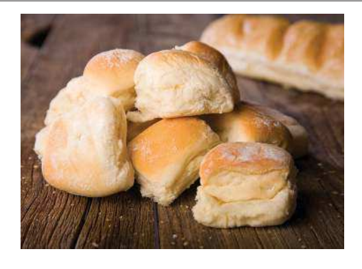
Figure 1.2: What do you call these?

All of the examples so far have been to do with accent; however, there is also a great deal of regional dialect variation in the UK. After accent, perhaps the most noticeable differences occur at the level of lexis, with people from different areas of the country having different words for even the most everyday things. Probably the most well-known area of disagreement is the one surrounding the item pictured in Figure 1.2. Depending on where someone grew up, this could be a picture of a bread roll, a barm, a morning roll, a bap, a batch, a cob, a scuffler, a stotty, or a buttery. And what about those things on your feet – are they trainers, runners, sneakers, joggers, sandshoes, plimsolls, pumps, creps, or kickers? No doubt you have a clear idea about the differences between what some of these words refer to, but the interesting thing is that these differences vary from region to region. It's not just that people from different places use different words for some things, rather that people from different places often use the same words for different things!