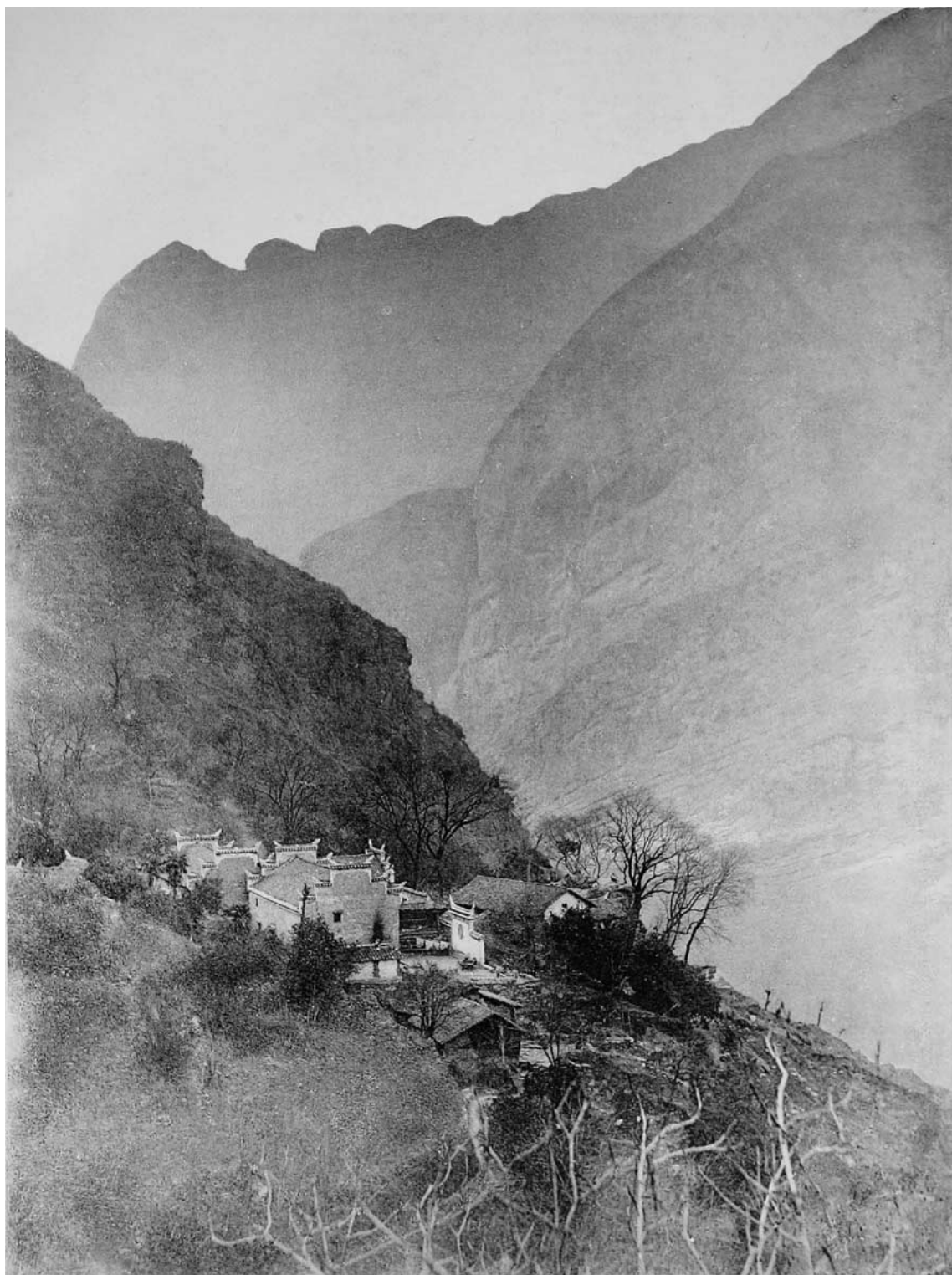
Country House on the Yangtse.