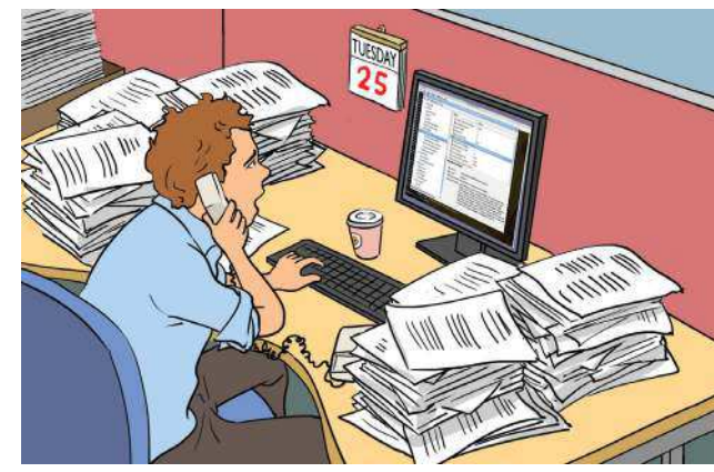
I wish it was Friday.