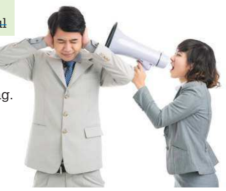
It's not a good idea to shout at your co-workers.

\overline{\mathbf{F}} Make sentences with your own ideas. Compare your ideas with a partner.