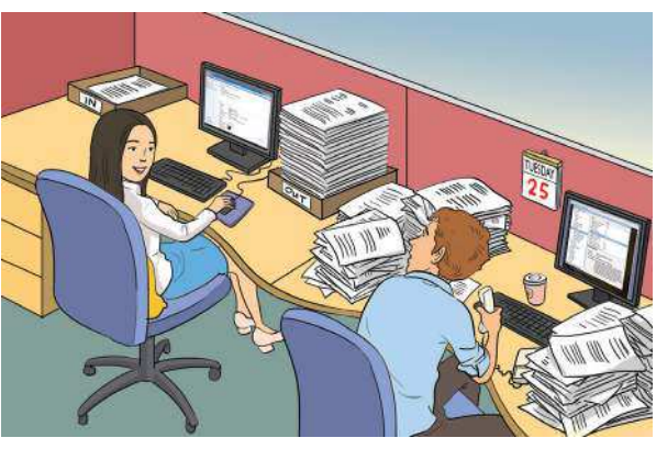
How do I do it? I just stay the night.