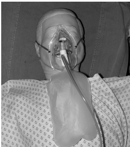
Figure 2.4 Hudson mask with reservoir.

along with the high flow of oxygen ( 12\text{--}15\text{ L min}^{-1} ), ensure minimal entrainment of air, raising the inspired concentration to approximately 80%, providing that the reservoir bag inflates and deflates with each breath. This requires a well-fitting, functioning mask and reservoir, and is often overlooked in clinical practice. An inspired oxygen concentration of 100% can be achieved only by using a close-fitting facemask with an anaesthetic breathing system that includes a reservoir, combined with an oxygen flow of 12\text{--}15\text{ L min}^{-1} (see below). Once stable, these patients should have oxygen therapy adjusted as described above.