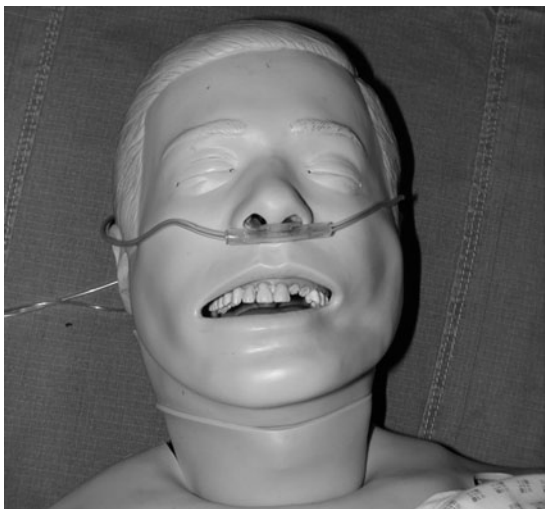
Figure 2.3 Nasal cannulae.

In a critically ill patient breathing spontaneously who requires a higher concentration of oxygen, a Hudson mask with a reservoir (non-rebreathing bag) can be used (Figure 2.4). A one-way valve diverts the oxygen flow into the reservoir during expiration. During inspiration, the contents of the reservoir,