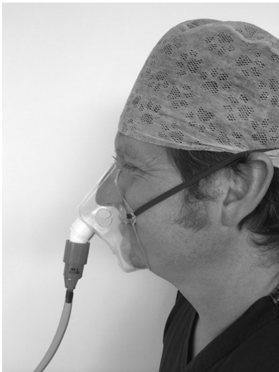
Figure 2.5 Use of a HAFOE mask delivering (in this case) 40% oxygen.

These devices deliver a fixed concentration for a given flow, and there are several interchangeable Venturis to vary the oxygen concentration (Table 2.2).