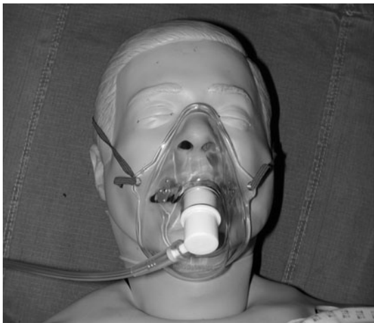
Figure 2.2 Hudson mask.