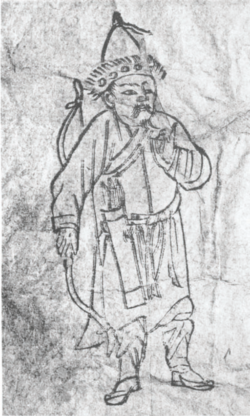
A NÜ-CHÊN TARTAR (14th Century)

Cambridge University Press 978-1-107-60602-9 - China and the Manchus Herbert A. Giles Frontmatter More information