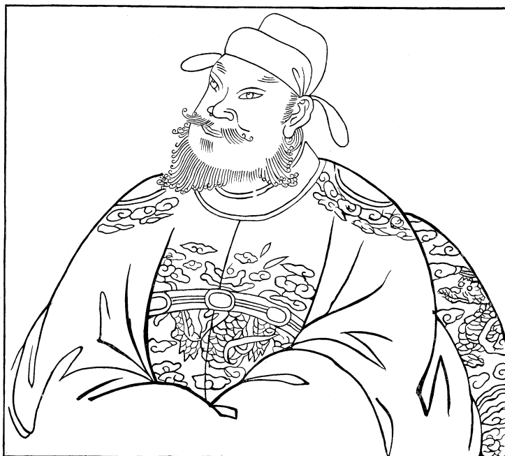
LI SHIH-MIN, EMPEROR T'ANG T'AI TSUNG