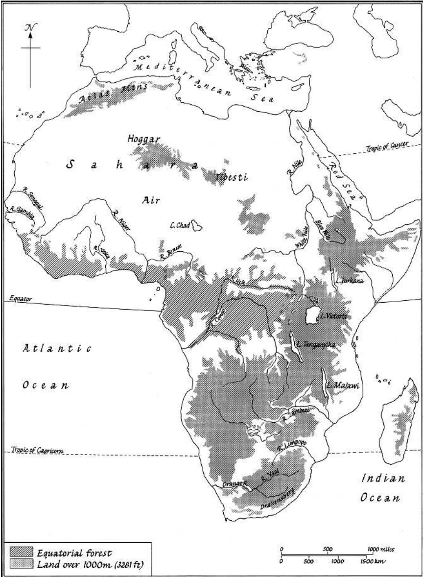
1. Main physical features.

Sparse populations with ample land expressed social differentiation through control over people, possession of precious metals, and ownership of livestock where the environment permitted it, especially in the east and south. Scattered settlement and huge distances hindered transport, limited the surplus the