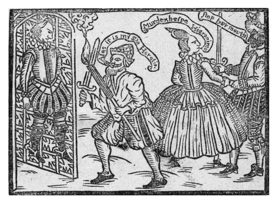
2 A stage-property arbour from the title page of the 1615 edition of Thomas Kyd's The Spanish Tragedy

I \, An arbour in an Elizabethan garden, such as might have been the imagined location for Act 2, Scene 3 and Act 3, Scene 1