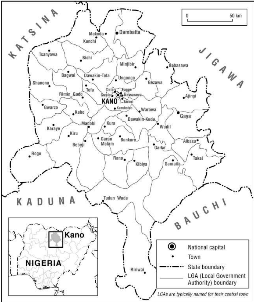
Map 2. Local Government Areas in Kano State, Nigeria