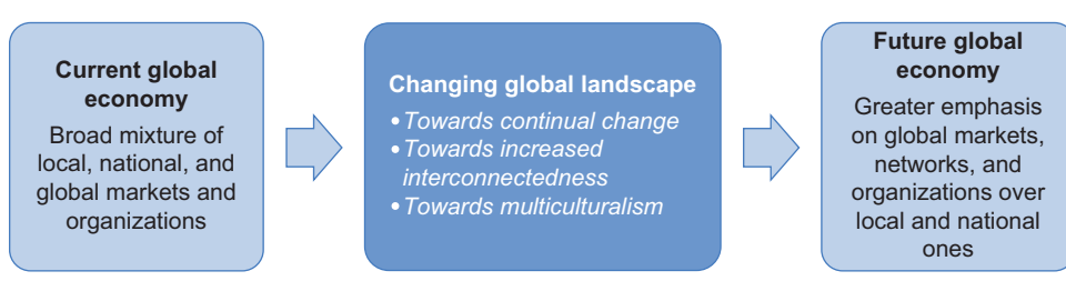
Exhibit 1.1 The changing global landscape

global business assume a sense of perpetual dynamic equilibrium. We are told that nothing is certain except change, and that winners are always prepared for change; we are also told that global business is like white water rafting – always on the edge; and so forth. Everything is in motion, and opportunities abound.