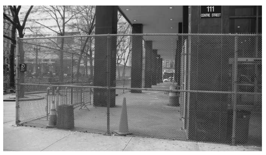
FIGURE P.I Home of New York County's Housing Court. Manhattan's Housing Court is located in the borough's Civil Court Building, depicted here, at III Centre Street. When originally installed, the chain-link perimeter fence displaced an encampment of homeless people who had taken up residence against the building's façade. In 2012, renovation of the adjacent Collect Pond Park exposed foundation remnants from the nineteenth-century Tombs.