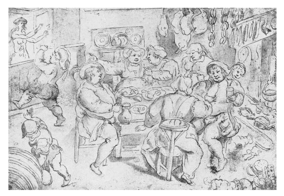
3 Maerten van Cleve, Lent surprising revellers at a carnival meal. The Warburg Institute, London

reformed Church of England, and sought to establish a 'purer' religion and polity, cleansed of all the old Catholic practices. Within three decades of the first performance of Twelfth Night the Puritan party had made powerful inroads in Parliament; Oliver Cromwell's English Revolution was the upshot, culminating in the public beheading of the ritualist Anglican King Charles I in 1649. Ben Jonson satirises the religious Puritan in the figure of Zeal-of-the-Land Busy in Bartholomew Fair (1614): a hypocritical epicure who speaks a preacher's jargon, he does not have the psychological or social complexity of Malvolio, who is described as only 'sometimes... a kind of puritan' (2.3.119). Maria goes on to qualify this epithet: