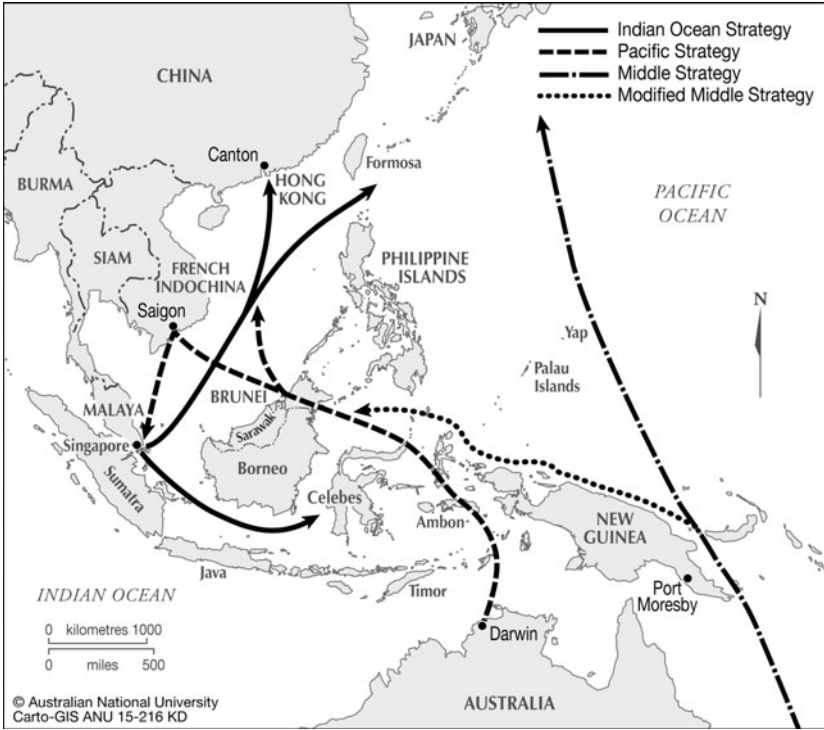
Map 3: Alternative strategy options, Australia 1944–45