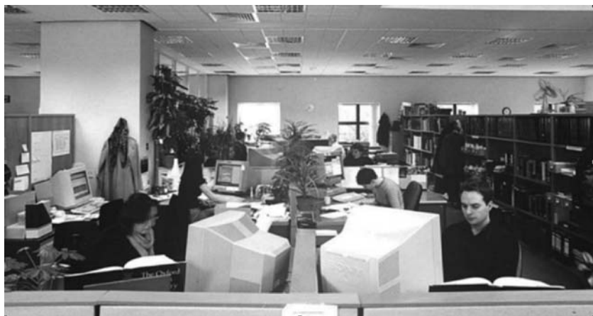
Figure 1.1 The modern OED office, with its open plan.

over time. Although full of people, the office was completely quiet, and its glass and metal fixtures gave it a modern feel. The environment was nothing like the photographs I had seen of the OED in the nineteenth century in which James Murray (1837–1915) stood in his pokey Scriptorium surrounded by a thousand pigeon holes, each of which was crowded with 4 \times 6 -inch ‘slips’ of paper that recorded each entry of the dictionary (Figure 2.6), or indeed the other office in the regal, sandstone-columned Old Ashmolean building in Broad Street which housed Henry Bradley (1845–1923) and his team (Figure 1.6). In comparison, this modern office was large and sterile, despite the efforts that editors had made to brighten their desks with plants and fluffy toys (Figure 1.1).