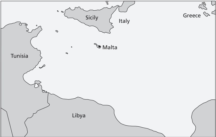
Map 2.2 Malta in its wider geographical context