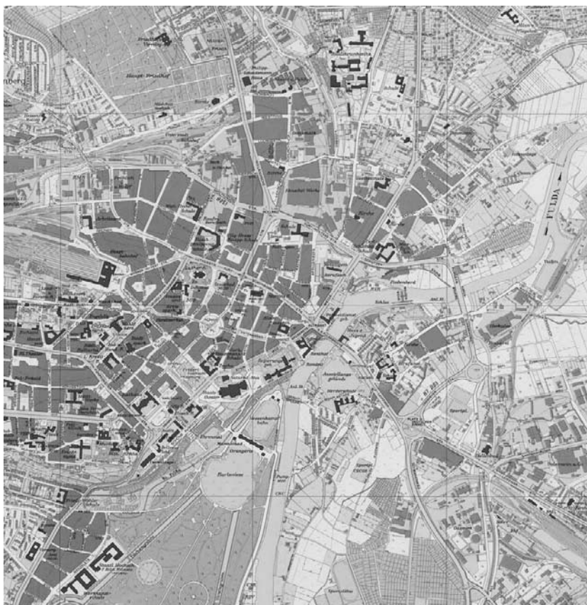
Map 2. The 'new city on historic ground': the old town of Kassel after the rebuilding in 1964. Note the new Kurt-Schumacher-Straße cutting through the historic old town and the virtual disappearance of the Lower New Town ( Unterneustadt ) on the right bank of the river Fulda.