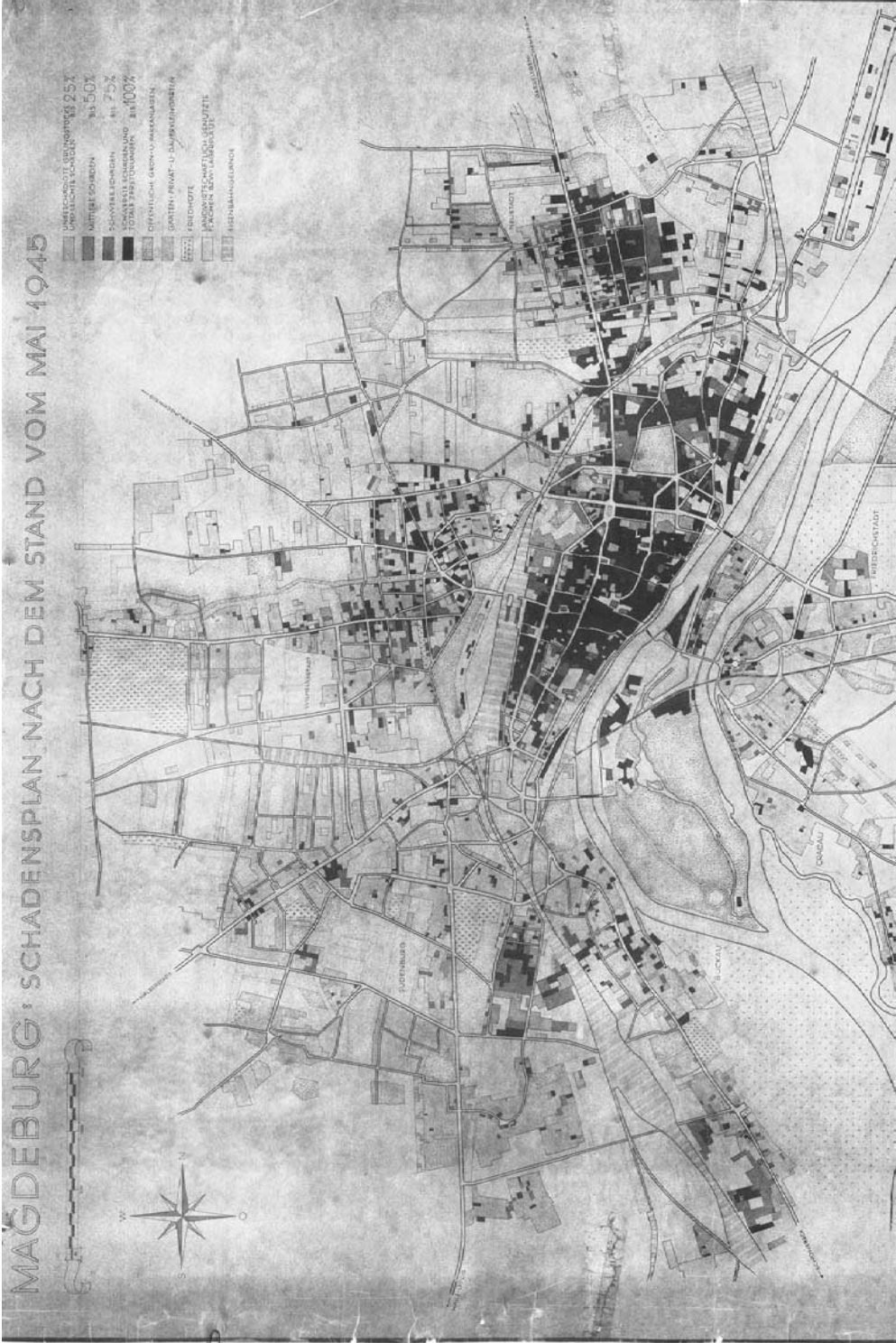
Map 3. Map of the city of Magdeburg in May 1945, indicating the damage inflicted during the war.