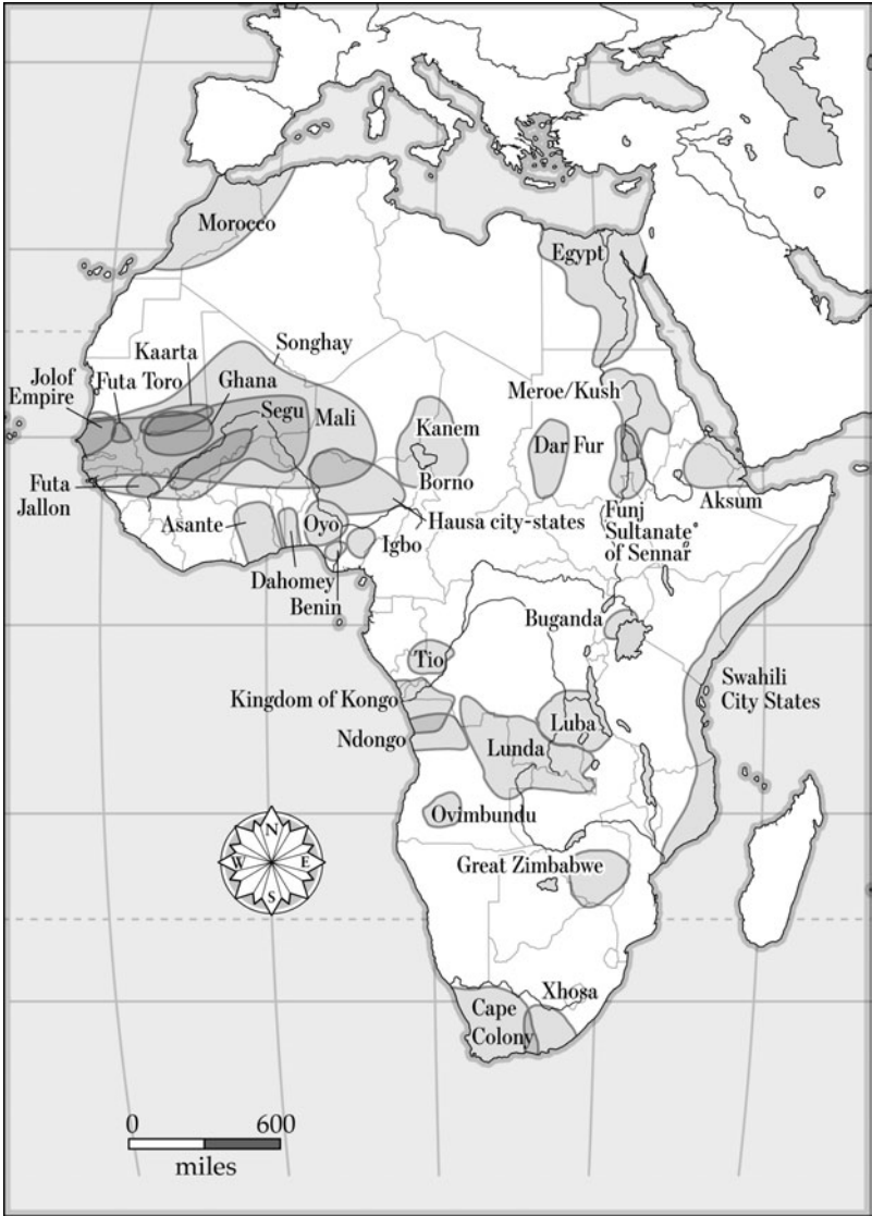
FIGURE 2. Selected African states before 1800 that are mentioned in text. Note: The borders of these states varied over time.