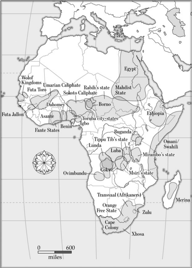
FIGURE 3. Selected African states after 1800 that are mentioned in text. Note: The borders of these states varied over time.