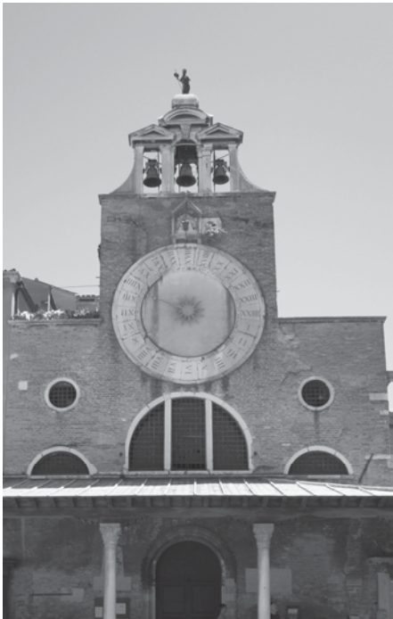
Figure 1. San Giacomo di Rialto. Restored in the eleventh and seventeenth centuries. Location: Venice, Italy.