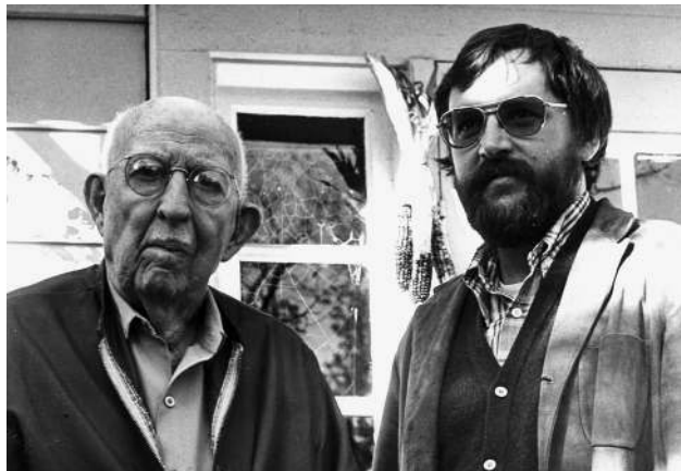
Figure 1.1. Professor J Harlen Bretz (left) at his home with Victor R. Baker (right).

nearby Cordilleran Ice Sheet. Named the ‘Spokane Flood’, this cataclysm neatly accounted for numerous interrelated aspects of the Channeled Scabland landscape and nearby regions. In his various papers Bretz noted features that marked the high levels reached by the floodwaters. These included scarps cut into the loess-mantled uplands adjacent to the scabland channels, high-level gravel-bar deposits of the floods, and divide crossings where one scabland channel spilled over into another (Bretz, 1923, 1928).