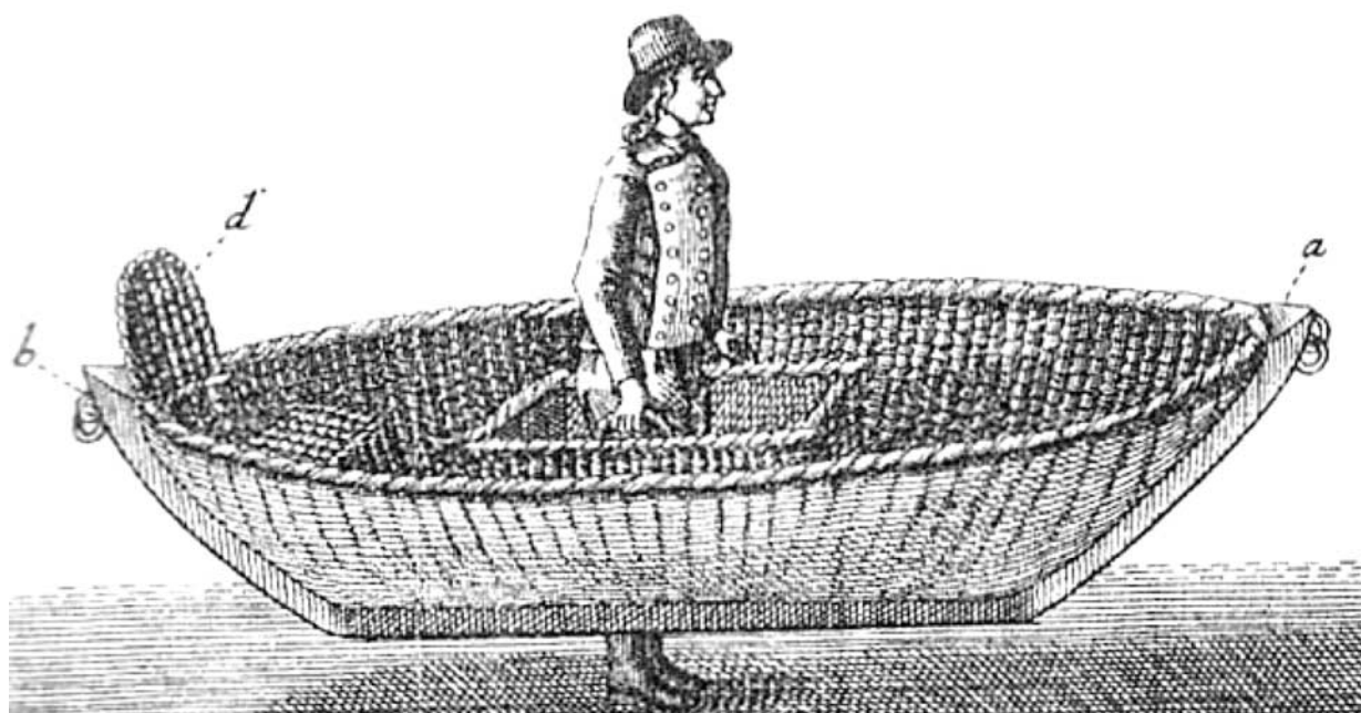
Fig. 1.3. An amphibious rescue craft designed for work on ice.

was awarded the Silver Medal of the Society. 29 He has been described as the father of resuscitation epidemiology. 30 He emphasized the need to keep accurate records and the need for speedy intervention. He advocated artificial ventilation with warm air or “ dephlogisticated air ” (see below) and suggested cricoid pressure and treatment of cardiac arrest with electric shocks. He was a methodical person and designed a pocket resuscitation kit in a case with “ a collection that comprehends every article except an electrical machine ” and also a description of the correct way to use these instruments 31 “. . . it will prove a very considerable acquisition to the resuscitation air.” He practiced his theories and describes vividly his experience of a remarkable recovery from drowning in a soldier with a head injury. 32