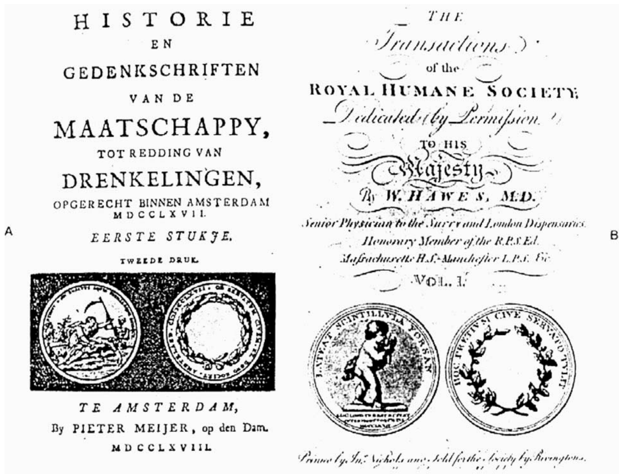
Fig. 1.2. (a) An account of the founding of the Amsterdam Rescue Society in 1767. (b) Cover of Royal Humane Society of London Transactions , showing medals awarded to rescuers.

as a catheter used for a male adult.” Dr. Munro, a professor of anatomy, had other prescient views, for in the same letter we read: