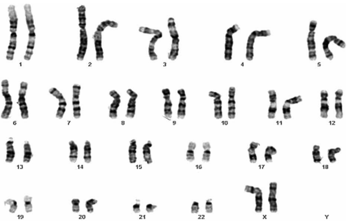
Fig. 1.1. The chromosome complement is called the karyotype. The somatic cells contain 46 (23 pairs) chromosomes. Of these, 22 pairs are common to men and women. These are called autosomes. These are conventionally numbered from 1 to 22 in decreasing order of size. The remaining chromosomes are the sex chromosomes: XX in females and XY in males. Members of the pairs of chromosomes carry matching genetic information.

Chromosome abnormality 95% of trisomy is due to non-disjunction at meiosis. 5% include translocation and mosaic forms.