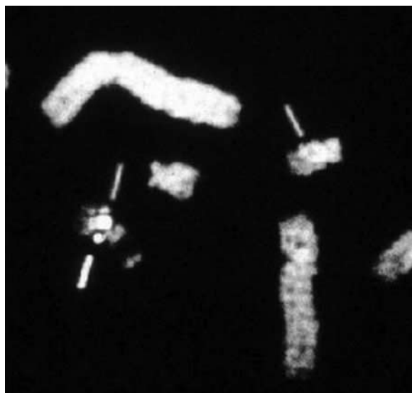
Fig. 1.3. In the FISH study, probes for specific DNA sequences on the chromosome of interest are labeled with a fluorescent dye. The probe is hybridized with the DNA sequences on a slide and analyzed under the fluorescent microscope. In a normal cell, two signals should be detected. If only one signal is present, it denotes missing information or deletion. This can be used to detect deletions at the ends of the chromosomes (telomeres) or within the chromosome (interstitial).

in 20%. There is a typical profile of better verbal and auditory compared with visuo-spatial skills. Most have ligamentous laxity (90%) which affects fine motor skills. Hyperacusis (increased sensitivity to sound) is common. Most adults have learning disability and are unable to live independently. Adult women have decreased bone density. Hypertension occurs in 50%.