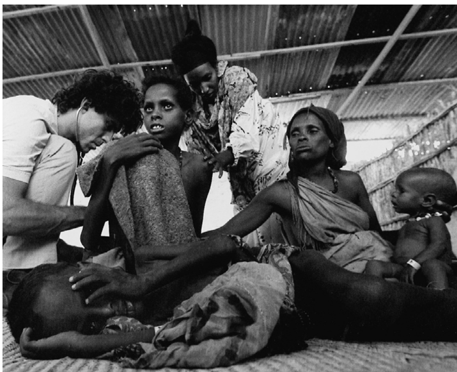
Camp outpatient clinic.