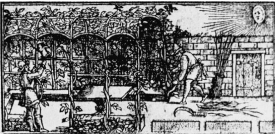
1 An arbour in an Elizabethan garden, such as might have been the imagined location for Act 2, Scene 3 and Act 3, Scene 1

The quarto of Much Ado About Nothing was printed in 1600. The fact that the names Kemp and Cowley appear as speech headings in 4.2 means that the composition must