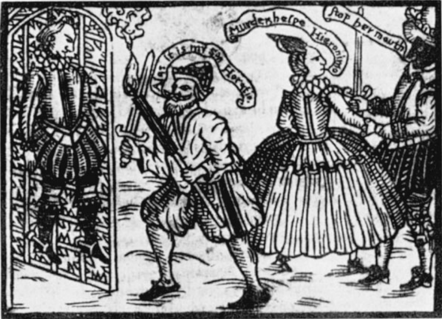
2 A stage-property arbour from the title page of the 1615 edition of Thomas Kyd's The Spanish Tragedy