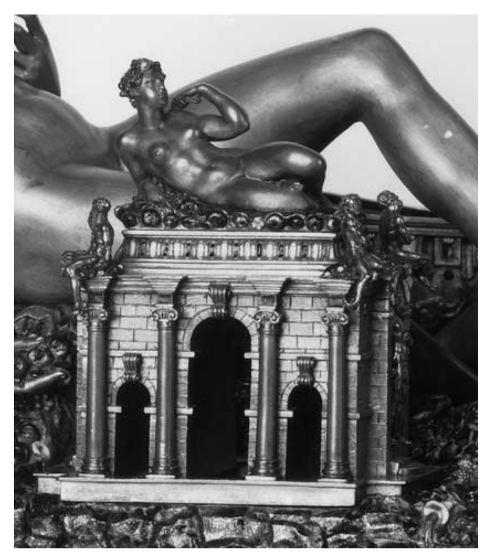
3. Benvenuto Cellini, Saltcellar (detail: Tempietto). Vienna, Kunsthistorisches Museum.

Beginning in 1554, the year in which the Perseus was unveiled, Cellini's efforts began to be shadowed by compromises and disappointments. He spent the better part of a decade developing plans for his own tomb, negotiating a space allotment with the brothers at two churches, designing its basic components (Fig. 4), stipulating which artists, following his demise, should execute its ornaments, carving with his own hand its centerpiece, a marble Crucifix. By the late 1550s, however, Cellini had failed to secure a location for its display; eventually, he gave the Crucifix, a fragment of larger plans, to the Duke.<sup>13</sup> Still more frustrated was Cellini's pursuit of the commission for the largest public project that came available in those years, the Neptune fountain Cosimo envisioned as the succession to the Perseus in the Piazza della Signoria. Having convinced the Duke to allow a competition for the assignment, Cellini spent months preparing first a small wax design, then, in the sealed-off bay behind the Perseus, a full-scale gesso mock-up of his idea, only to lose the commission to Bartolommeo Ammannati.<sup>14</sup> Assigned to make a series of bronze reliefs for the pulpits of the Florence cathedral, his work on these was interrupted when Cellini was imprisoned, twice, for assault in 1556, and for sodomy in 1557.