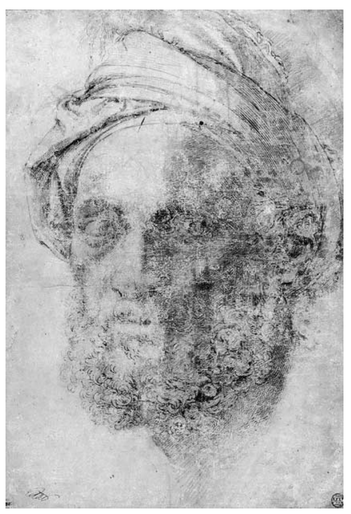
2. Michelangelo, Self-Portrait . Paris, Louvre.

sculptor's field: the artist and writer Benvenuto Cellini. An heir to Michelangelo in a culture grappling with the question of what good works were, Cellini demonstrated an unparalleled concern with the functions that constituted the sculptural vocation. His works orient an understanding of the sculptural act.