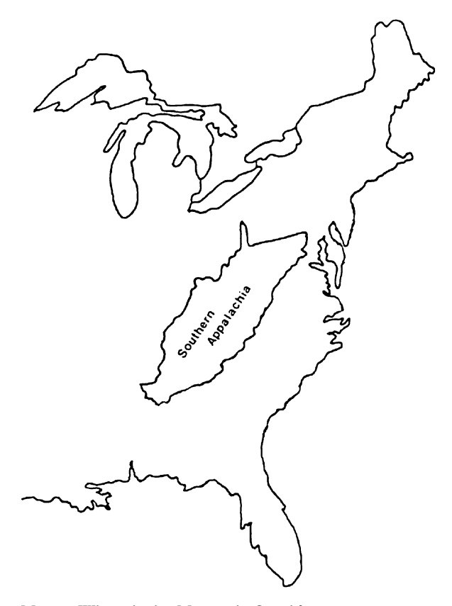
Map 1. Where is the Mountain South?

nonslaveholding majority and a large surplus of poor white landless laborers. In geographic and geological terms, the Mountain South (also known as Southern Appalachia) makes up that part of the U.S. Southeast that rose from the floor of the ocean to form the Appalachian Mountain chain 10,000 years ago (see Map 1). In a previous book, I documented the historical integration of this region into the capitalist world system. The incorporation of Southern Appalachia entailed nearly one hundred fifty years of ecological, politico-economic, and cultural change. Beginning in the early 1700s, Southern Appalachia was incorporated as a peripheral fringe of the European colonies located along the southeastern coasts of North America. During the early eighteenth century, the peripheries of the world economy included eastern and southern Europe, Hispanic America, and "the extended Caribbean," which stretched from