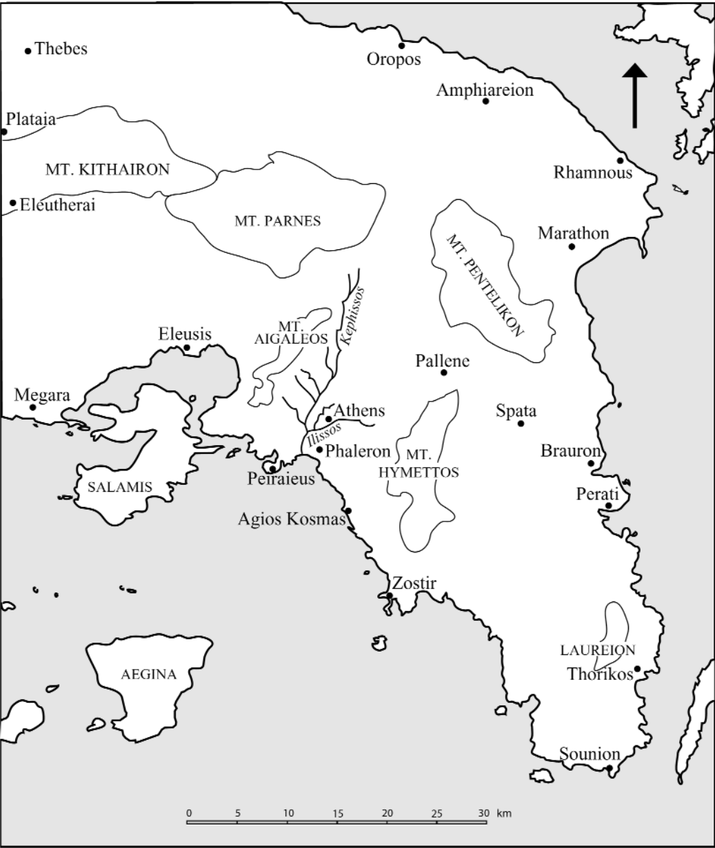
4. Map of Attica. Drawing after M. Djordjevitch in Camp (2001), fig. 248.

sanctuaries outside the city’s walls but within the city’s territory. Other sanctuaries, such as the great Sanctuary of Zeus at Olympia (Fig. 5), developed in places not controlled by a major polis; these became Pan-hellenic (for all Greeks) or interpolis sanctuaries where rival individuals and states could meet and compete.