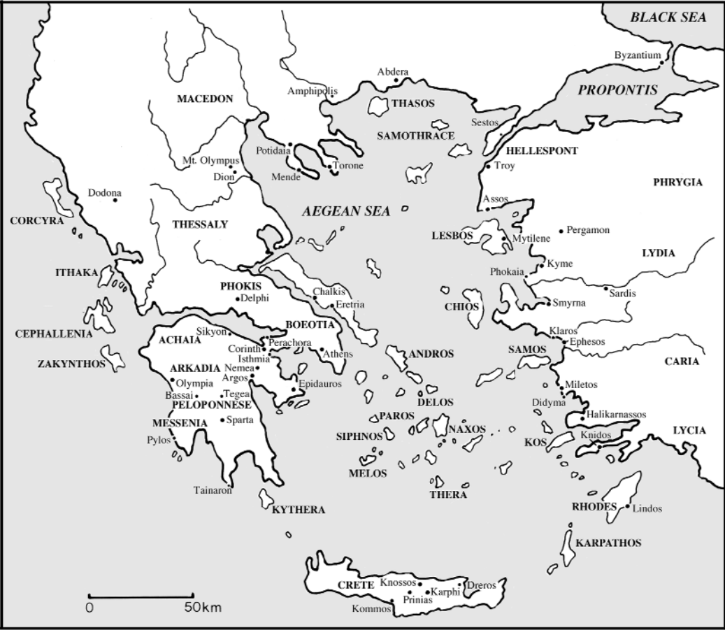
2. Map of Greece and the Aegean. Drawing after David Bosse and Mary Pedley in Pedley (1990), fig. 7.

Place marks the origins of sanctity. Where sanctuaries were situated in the landscape, or in town, and the significance of their siting are two of the important questions we face. Phenomena of nature – caves, hilltops, unusual rock formations – excited interest in the supernatural and became centers of religious devotion. Some remained small and remote, while others grew, with the addition of buildings, into more monumental places of worship. The counterparts of such shrines in nature were those that were man-made from the start, some located at prominent points within city walls, others outside the urban nucleus. Each city-state, or polis ( pl. : poleis) was provided with both urban sanctuaries and