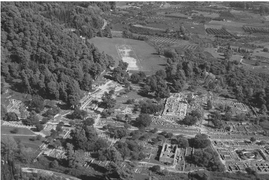
5. Sanctuary of Zeus at Olympia. Aerial view from the west showing remains of major features, temples, and treasuries.

Sanctuary buildings, spaces, and offerings vary in number, size, shape, and materials, but in the larger sanctuaries you can see general similarities: altars, temples, and stoas, trees or groves, statues and other offerings both communal and individual. All these elements were sacred and, taken together in various combinations, comprise a sanctuary. The spatial arrangement, the architectural forms, and the dedications found in Greek sanctuaries are primary topics in this survey.