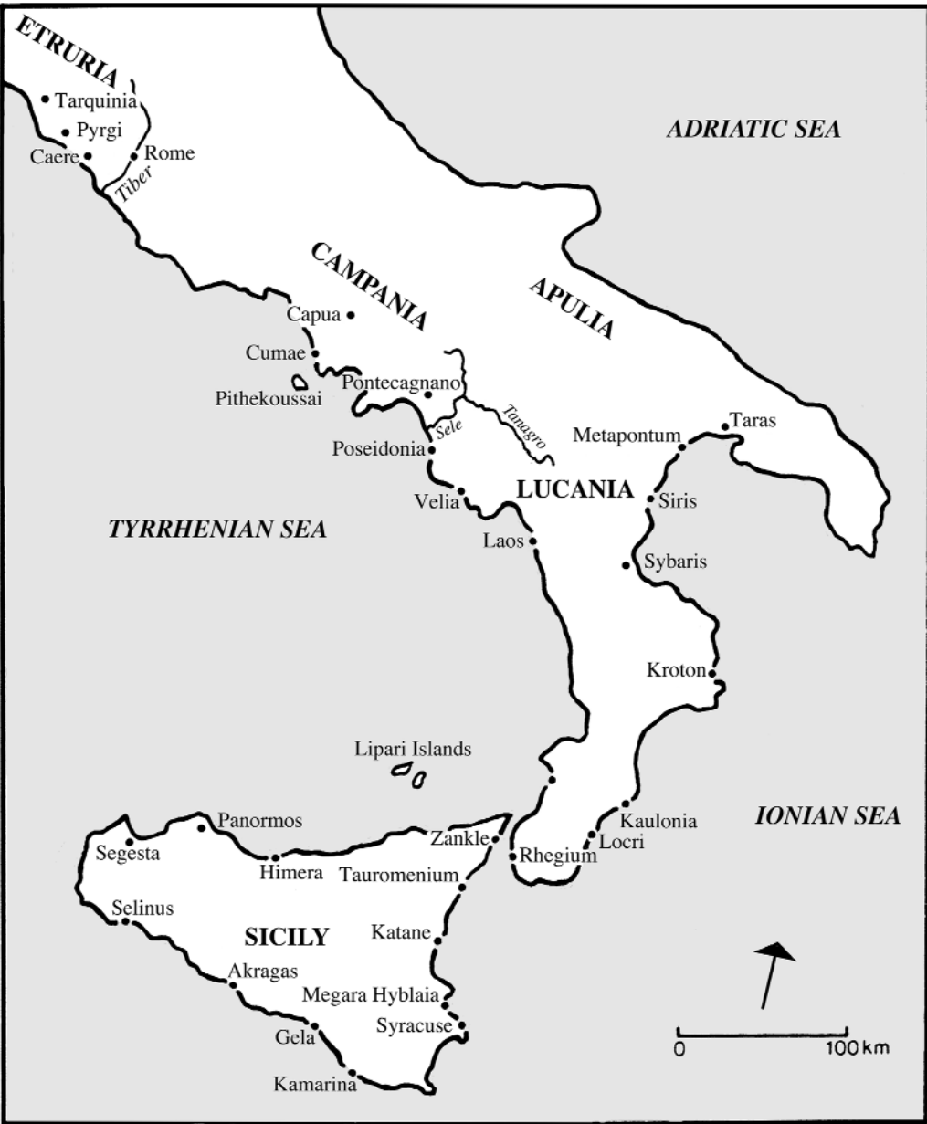
3. Map of southern Italy and Sicily. Drawing after David Bosse and Mary Pedley in Pedley (1990), fig. 1.