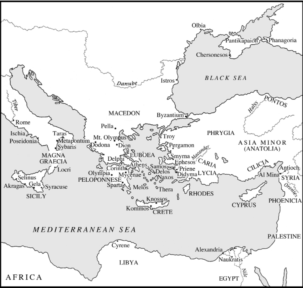
1. Map of the Greek world. Drawing after Paul Butteridge in Pedley (2002), fig. 0.2.

The first part of the book addresses major themes: