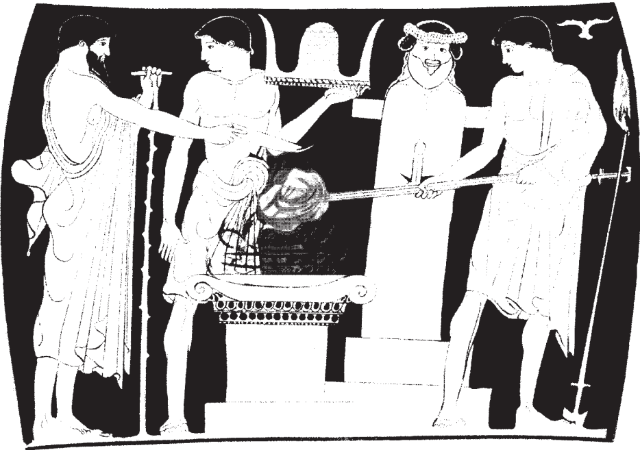
6. Drawing of a sacrifice scene showing an altar ( foreground ), a herm ( background ), and three participants: One pours a libation onto the altar ( at the left ), another ( center ) holds a receptacle for the sacrificial instruments, while the third roasts the sacrificed animal's entrails on a spit. Detail of an Attic red-figure krater (Naples, National Museum no. 127929). After Monumenti Antichi 22 (1913), pls. vol., no. 80.

Smaller sanctuaries might have hardly anything at all that could pass for a structure, beyond an altar (or hearth) or two and a built (or imagined) boundary. But larger sanctuaries had many buildings, several of which were constructed, in terms of location and accessibility, with ritual activities in mind. Ritual and architecture often went hand in hand.