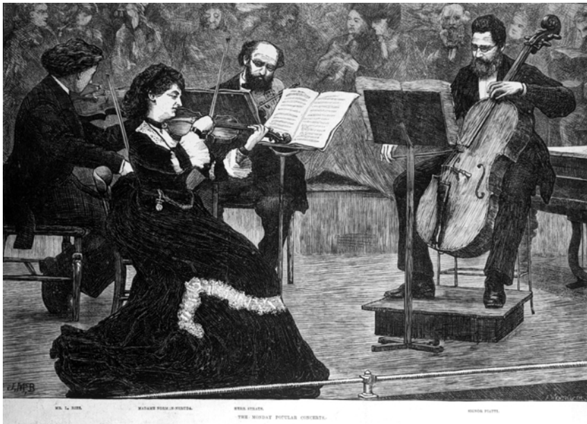
Figure 1.2 Quartet performing at the Monday Popular Concerts in St James's Hall, London; from an engraving in the Illustrated London News (2 March 1872). The players are Madame Norman-Neruda (violin 1), Louis Ries (violin 2), Ludwig Straus (viola) and Alfredo Piatti (cello)