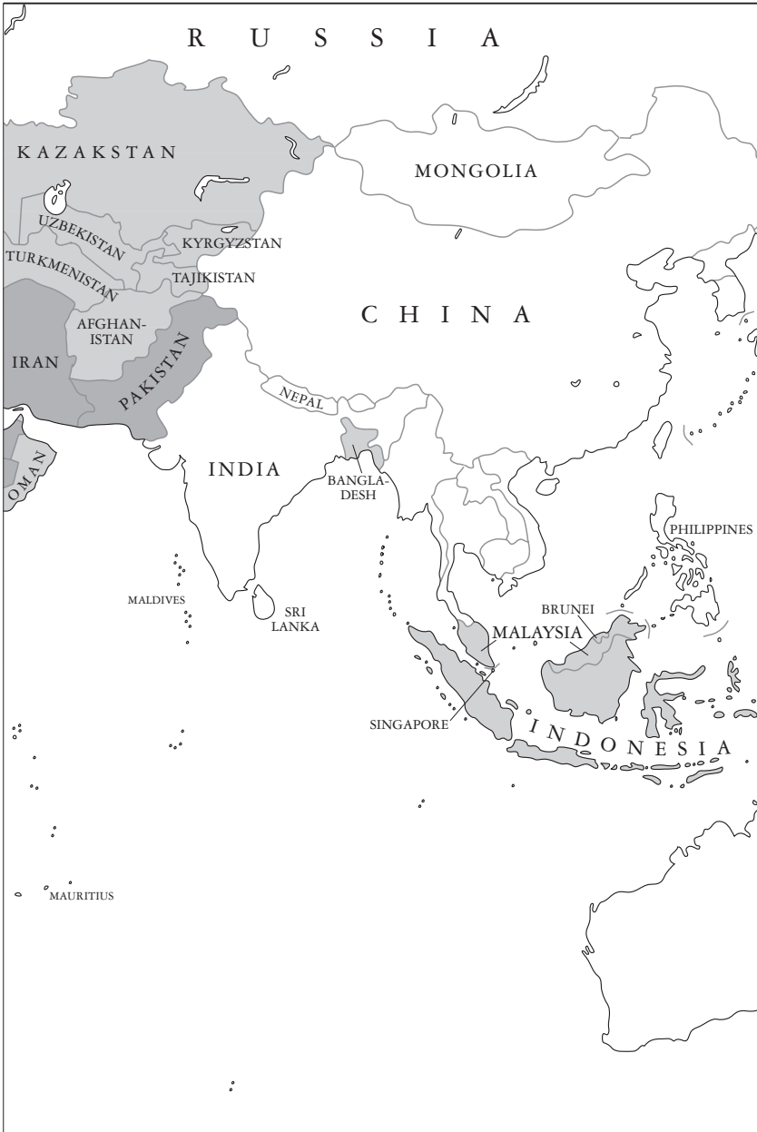
Map 2. (cont.)