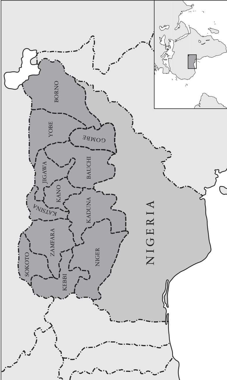
Map 3. The spread of Shari' criminal law in Nigeria (dark grey)