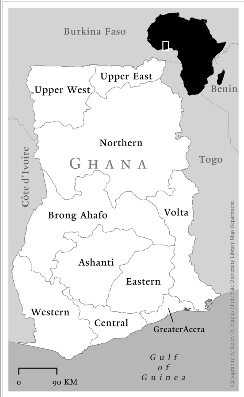
MAP 2. Map of Ghana.