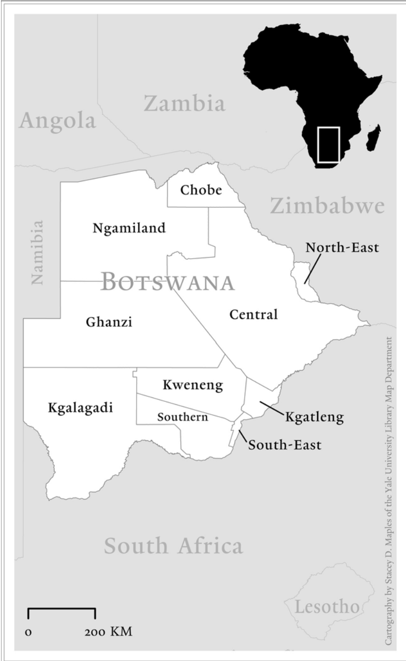
MAP 1. Map of Botswana.