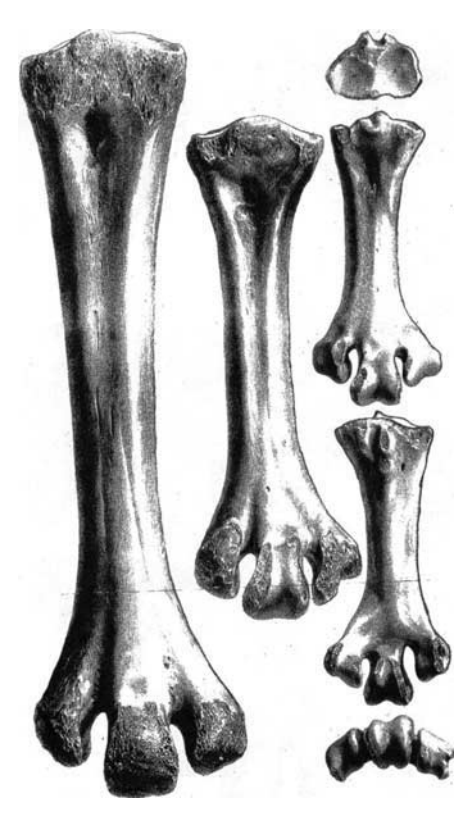
FIGURE 1.1. Tarsometatarsi of various species of moa, Dinornithiformes, sent from New Zealand to Richard Owen at the Natural History Museum, London, in the 1840s (from Owen 1879, pl. 27).

many classic nineteenth-century ethnographic and historic accounts of wildfowling to interpret the significance of bird remains for human prehistory. A comprehensive worldwide survey published ten years later includes references to only about 200 publications on bird remains from archaeological sites (Dawson 1969). That figure today has expanded tremendously.