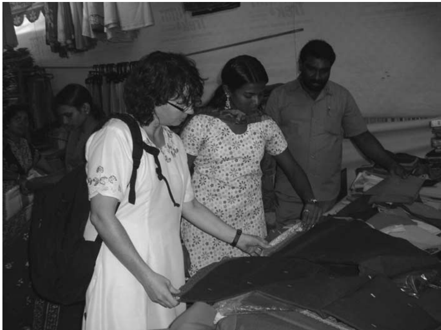
Figure 1 Shopping and bargaining with tourists – a classic situation which calls for English (here in India)

infrequently people enjoy using it in “their own” way. In many places local ways of speaking English have become a new home dialect which, like all local dialects, is used to express regional pride, a sense of belonging to a place which finds expression through local culture, including language forms. Furthermore, in many countries of Africa and Asia, where English was introduced just one or two centuries ago, there are now indigenous children who grow up speaking English as their first and/or most important, most frequently used, language. Some of them are not even able to speak the indigenous language of their parents and grandparents any longer. Come to think of it – isn’t this an amazing phenomenon?