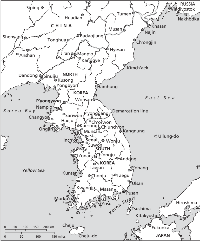
Map 1. The Korean peninsula