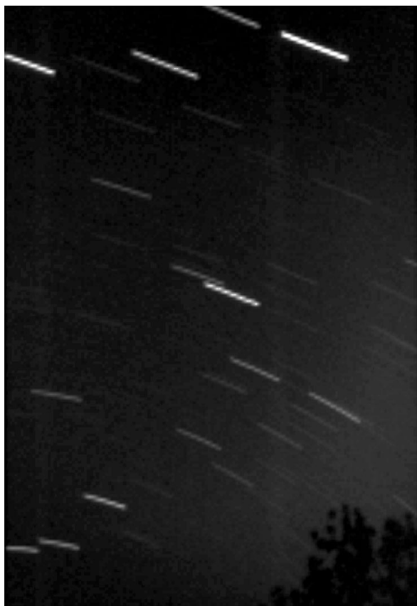
Figure 2.2 Star trails – this is what happens when you expose much longer than 20 seconds. A 30-minute fixed-tripod exposure of the constellation Bootes taken in 1982 on Ektachrome 200 Professional with a 24-mm wide-angle lens at f/4 .