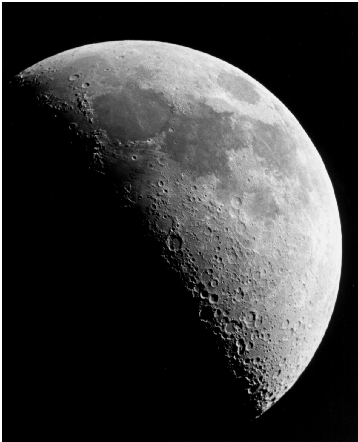
Figure 1.1 The moon photographed at the prime focus of a 12.5-cm (5-inch) f/10 Schmidt-Cassegrain telescope. A half-second exposure on Kodak Technical Pan Film developed in Technidol LC; clock drive running.