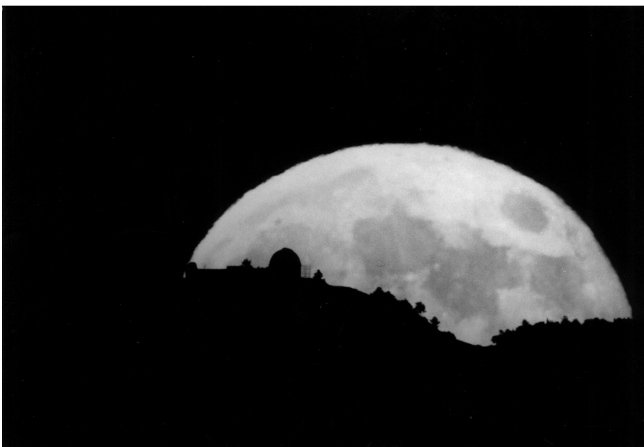
Figure 1.5 A picture well worth sharing: the moon rising over Lick Observatory. Richard A. Milewski carefully calculated the position of moonrise to take this picture.