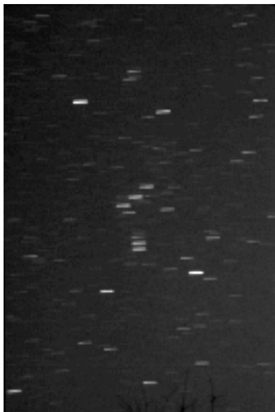
Figure 2.1 Twenty-second and five-minute fixed-tripod exposures of Orion. Fuji Sensia 400 film, Minolta 50-mm f/1.7 lens wide open.