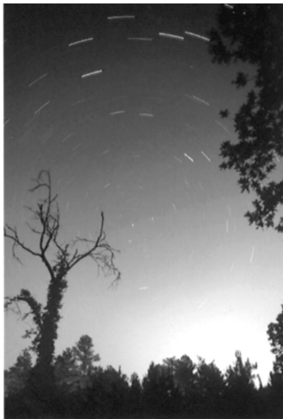
Figure 2.3 Star trails centered on Polaris – but mostly the lights of a nearby town. A 30-minute fixed-tripod exposure taken in 1982 on Ektachrome 200 Professional, 24-mm lens at f/4 . Compare this with Plate 2.1, which was taken in the country.

When you get your film developed, look at the results. The 20-second exposure should show the stars much as they actually looked in the sky – but if you look carefully, you'll see that the film caught some stars that were too faint for you to see. In the 5-minute exposure, though, the stars won't look like stars. The star images will be short lines or curves instead of points – and if you exposed longer, the lines or curves would be longer. It's as if the stars had been moving.