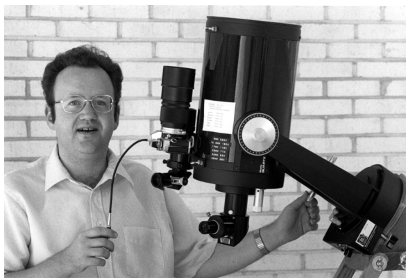
Figure 1.2 The author gets ready to photograph star fields with a camera and 180-mm lens mounted “piggy-back” on a 20-cm (8-inch) Schmidt-Cassegrain telescope.

interesting objects (planets, star clusters, or the like) without a map. Don't be seduced by computer-controlled telescopes; they save time if you have a busy observing program, but you can't use them effectively unless you already know the sky.