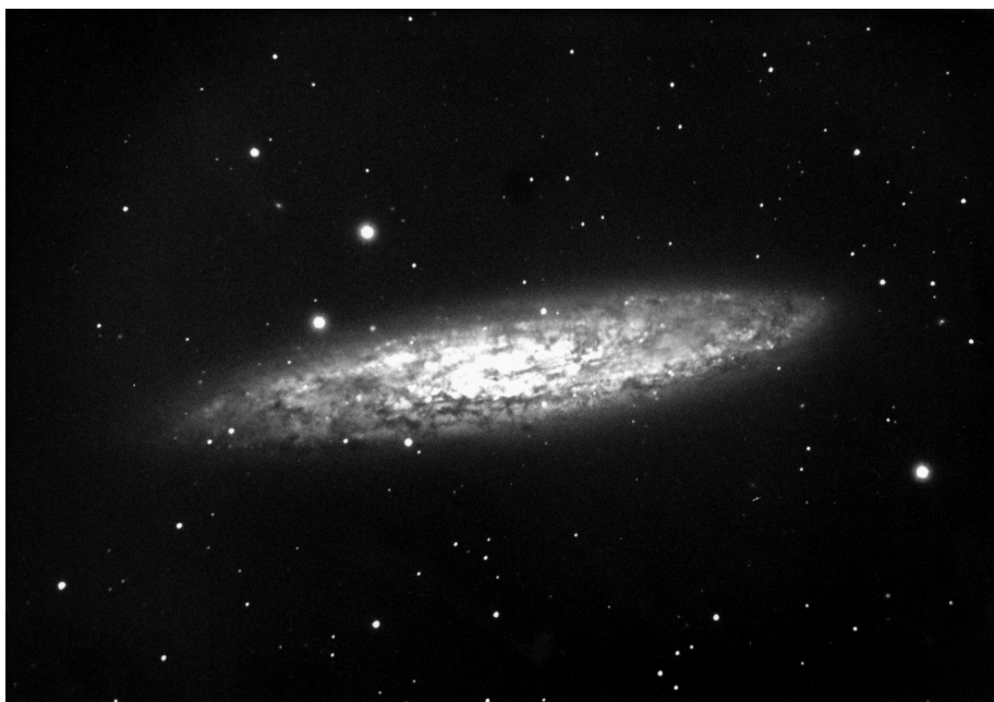
Figure 1.4 An example of very advanced amateur work. The galaxy NGC 253; a 60-minute exposure on hypersensitized Kodak Technical Pan Film with a 14-inch f/7 telescope.