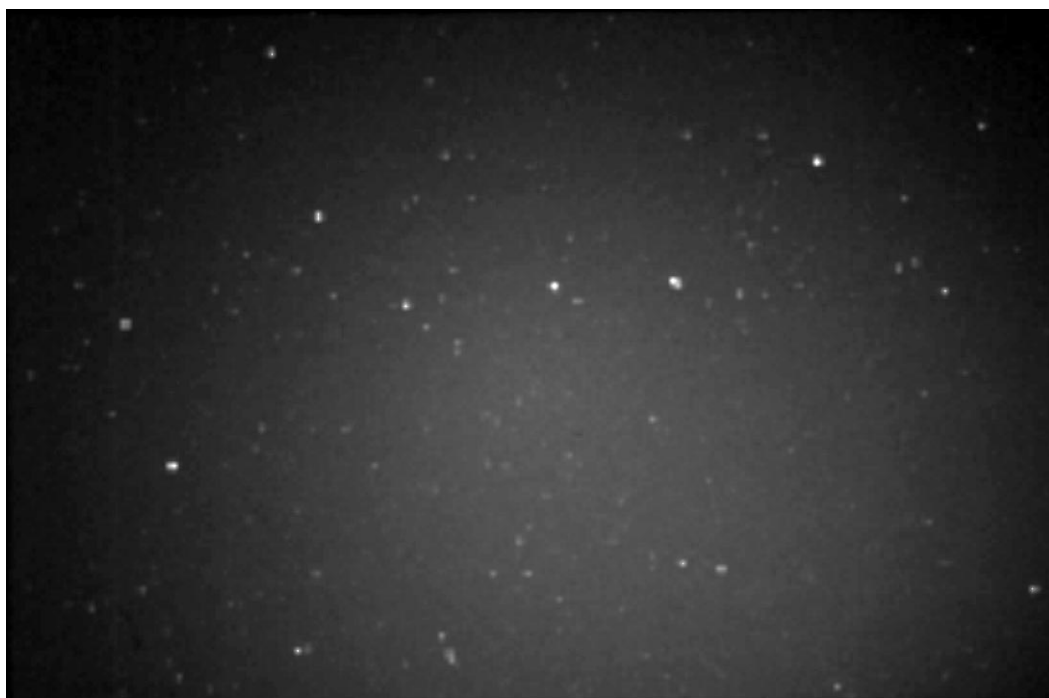
Figure 2.5 The familiar Big Dipper or Plough (Ursa Major). A 30-second fixed-tripod exposure, 50-mm f/1.8 lens wide open, Ektachrome P1600 film.