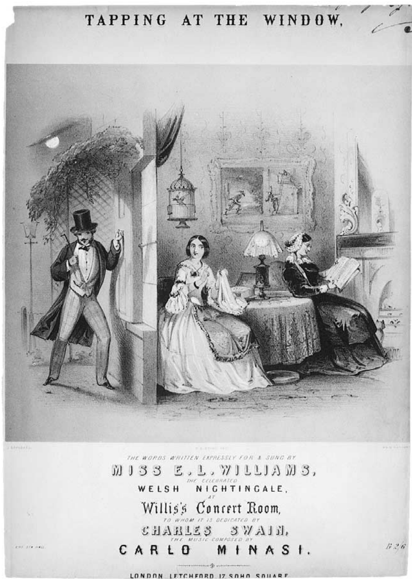
Fig. 2 Music sheet, mid-century.