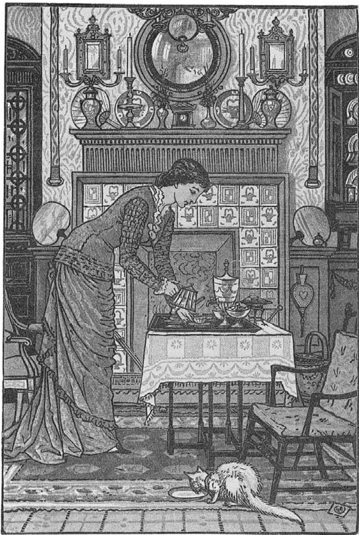
“MY LADY’S CHAMBER.”