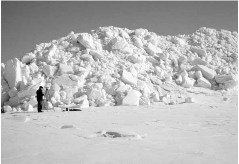
Fig. 1.3 Wind piled sea ice blocks on the shore of the northern Gulf of Bothnia, Hailuoto, Finland.

Wind is everywhere and in the circumpolar environments and on high mountains it is strong. There its force is not much limited by high vegetation like forests. When considering the importance of aeolian processes in cold environments we have to keep in mind how vast areas of the earth are covered by snow permanently or seasonally. Dry snow is relatively light material and easily drifted. Snow as such does not form geomorphic features but when it is accumulated in big amounts and forming glaciers and snow patches or melting, then it produces erosional and depositional landforms of nival origin and wind drift is the primary reason for them. In certain places snow cover is thin and in other places thick and the controlling factor is wind. Blowing snow itself is a major problem in cold environments, e.g. Canada (French & Slaymaker 1993: 9). Accumulation and redistribution of snow in the mountains has considerable effects on snow transport, glacier dynamics, snow drifts and avalanche danger (Dyunin & Kotlyakov 1980).