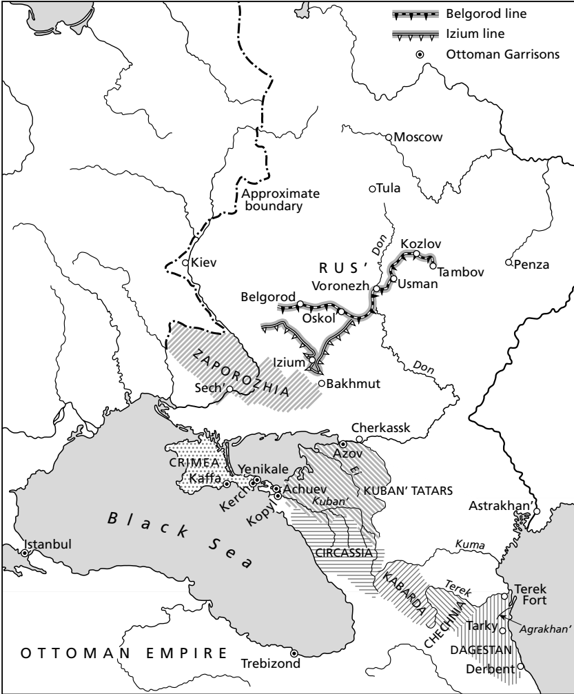
2. The wider world of the Don steppe frontier