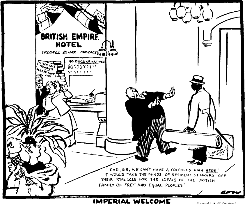
Imperial Welcome. Cartoon by Low; reproduced by kind permission of London Express Newspapers