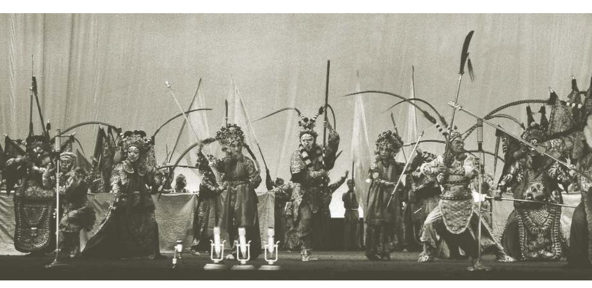
A scene from Havoc in Haven (Nao Tian Gong).