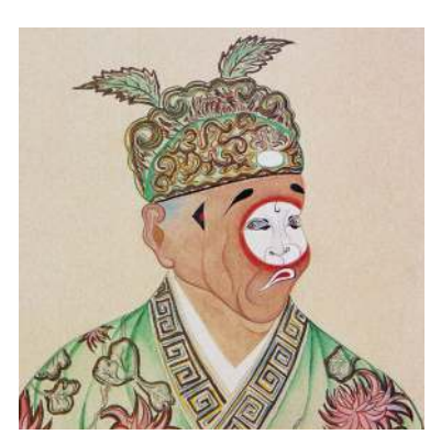
A male clown. Painted by Zhang Jinliang.

face a rough and simple character, a blue face bravery and pride, a white face treachery and cunning, and a face with a white patch a fawning and base character. To show kinship, father and son can have faces of the same color with similar patterns. A face with a dignified pattern belongs to a loyal official or a loving son, a blue-and-green face to an outlaw hero, a face with kidney-shaped eyes and wooden club-shaped eyebrows is a monk, a face with sharp eye corners and a small mouth is a court eunuch, and a face with a white patch is a minor character. Facial makeup can also allow actors to expand the scope of their acting. If animals are to be portrayed, there is no need to have real horses and cattle on the stage. For example, in the play titled the Jinshan Temple, there is a scene where an army of shrimps and crabs fight an evil character. They are played by