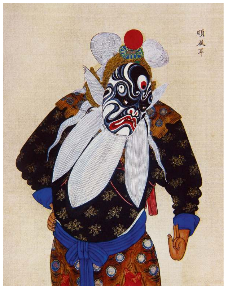
Portrait of an opera character made by an official painter of the Qing court. The style of the facial makeup is rather old.

In the past, Beijing residents liked to visit temple fairs. They were held at different locations in the city during Spring Festival, the Chinese New Year, bringing great joy to children and adults alike. Peddlers sold a toy called the Golden Cudgel, a weapon used by the Monkey King, the hero in the classic novel Pilgrimage