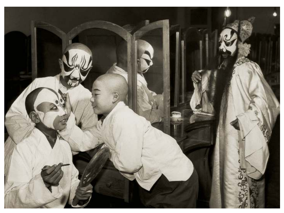
Third-year students at the China Opera School learn to paint faces. Photo taken in 1964.

be exaggerated, it is painted. The most common facial makeup types are jing and chou . Jing is an actor with a painted face and chou is the role of a clown. For different roles with different makeup types, the methods of color application and painting are different. For some makeup types, such as for a hero, color is applied to the face with the fingers; no paintbrush is used. For most types of warrior, colors mixed with oil are painted on the face, and meticulous attention is paid to shades of coloring, the size of eye sockets and the shape of the eyebrows. For treacherous court officials, the face is painted white, with the eyebrows and eye corners slightly accentuated and a couple of "treachery" lines added.