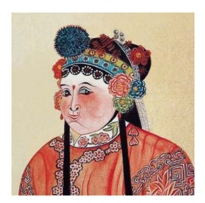
A female clown. Painted by Zhang Jinliang.