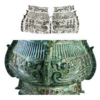
Fuding you (detail).

During the Sui (AD 581-618) and the Tang (AD 618–907) Dynasties, a system of official examinations was developed to select mandarins (scholar-officials) to serve the court. Therefore, an elite cultural class was formed in the early stages of Chinese imperial history. The aim of scholars was to do well in the examination, so they would be selected to become mandarins and achieve their political ambitions. To reach this ultimate goal they first had to read and practice calligraphy thoroughly and extensively in order to become a cultured person and "gentleman." Painting and writing poetry were very important in this endeavor. The greatest Chinese philosopher and scholar, Confucius, said to his fellow students: "ambition must come from truth (The Way); be based on integrity, exercised through kindness, and expressed through the arts." This suggested