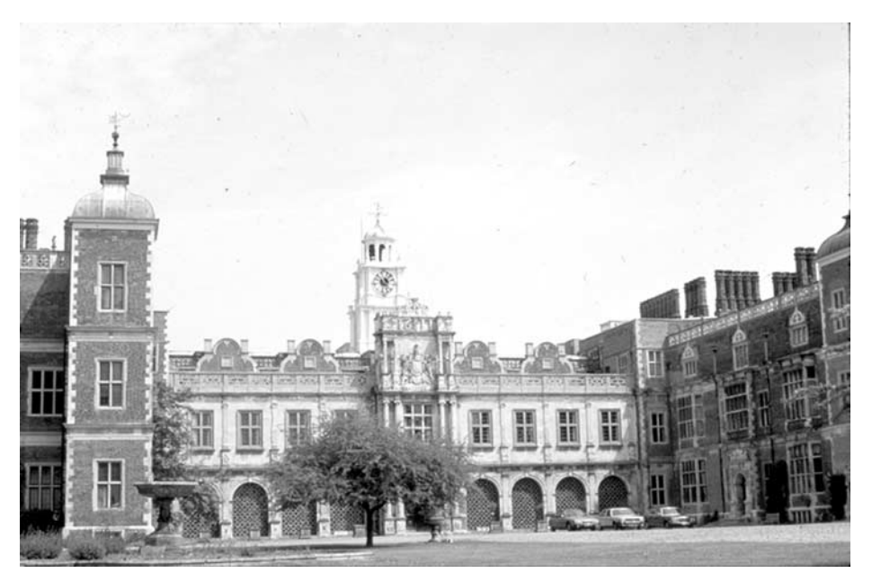
2. Hatfield House, Hertfordshire, portico added in 1610.

prescribed patterns of carving, and metalworkers know the best methods of forging raw materials. The demands of local conditions and practices are more pervasive than the often abstract ideas and images contained in books. Nationalism, and the desire to form ever more sophisticated cultures in the vernacular, were equally important compared with any more international desires of competition and uniformity.