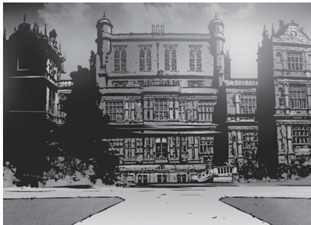
3 ..... lives at Wayne Manor, Gotham City, USA.