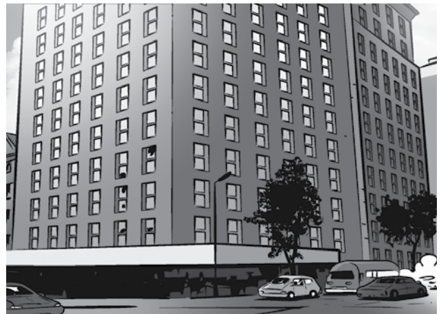
2 ..... live at 1938 Sullivan Lane, Metropolis, USA.