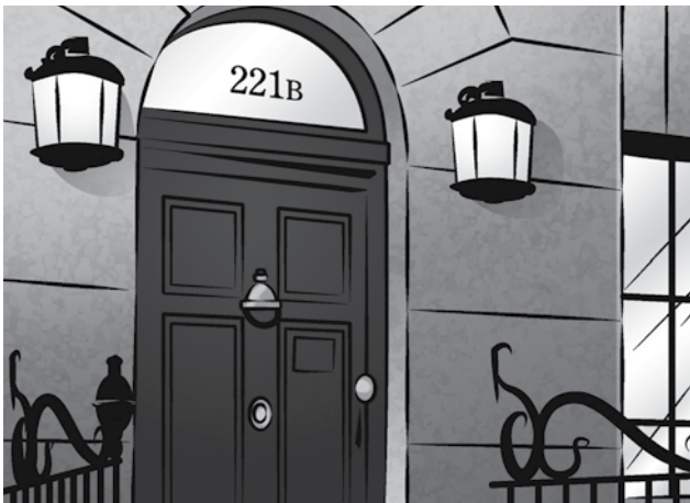
1 ..... lives at 221B Baker Street, London, UK.

Batman Sherlock Holmes Superman and Lois Lane