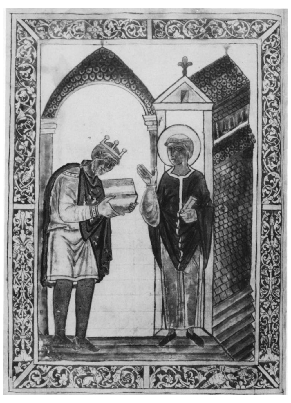
Corpus Christi 183, f. 1<sup>v</sup> (reduced)