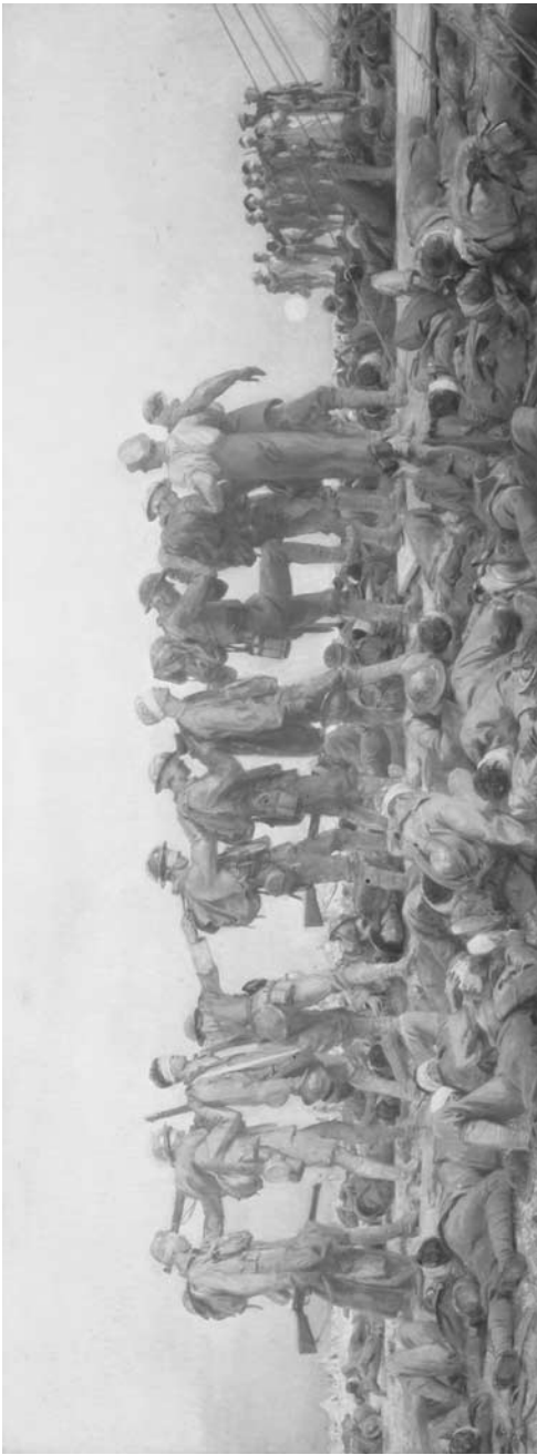
Figure 1.1. John Singer Sargent, Gassed , 1919. Oil 2290×6100 mm. Imperial War Museum, London.