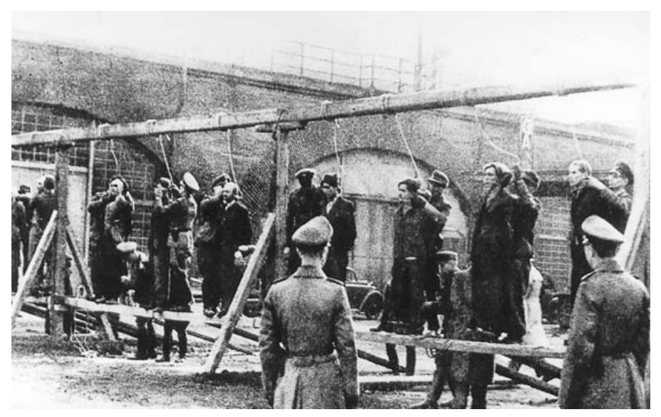
The public execution of a group of Edelweisspiraten in Cologne, 1944.

slogans used by the Edelweiss Pirates in street graffiti was 'Eternal War on the Hitler Youth'. They operated in small local gangs. In the inner-city areas they congregated on street corners, hung around parts of the city centre or met in local parks. It was difficult for the Nazi authorities to distinguish their behaviour from less politically challenging forms of juvenile delinquency. It seems the young people who joined the Edelweiss Pirates had grown sick of the lack of freedom which the Nazi regime had imposed on German society.