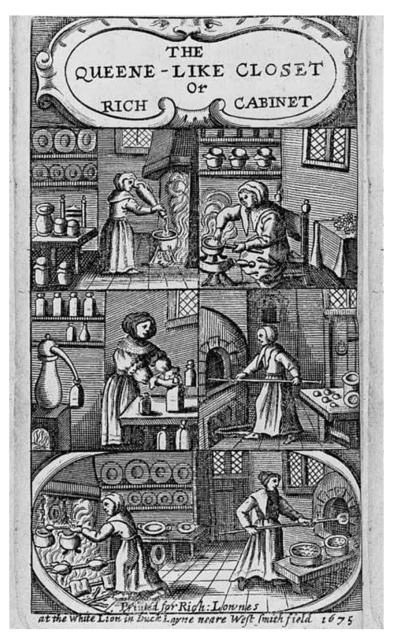
Fig. 2 Hannah Woolley's domestic guide shows the housewife busy in the art of distilling, baking, cooking and preserving. From The Queene-like Closet or Rich Cabinet (London, 1675).