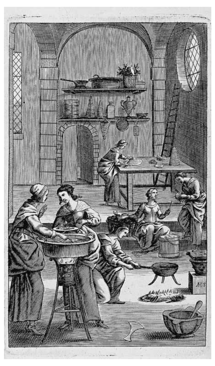
Fig. 1 Kitchen scene of women preparing pastries, vegetables and broths. From Nicholas de Bonnefons, The French Gardiner , trans. John Evelyn (London, 1658).