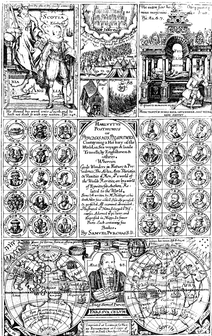
1. Title page from Samuel Purchas, Purchas His Pilgrimes (1625).

discovered more recently and, within each section, a chronological order from earliest to latest.