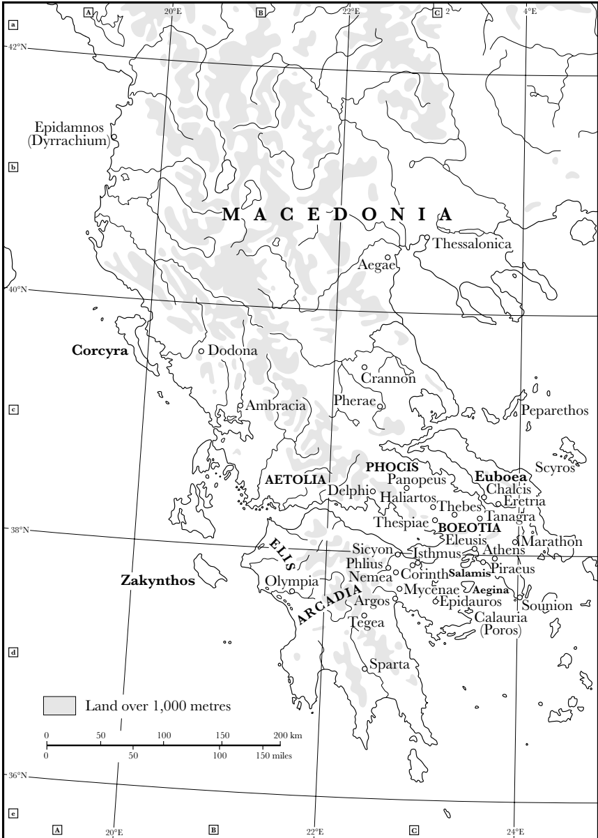
1. The Aegean World